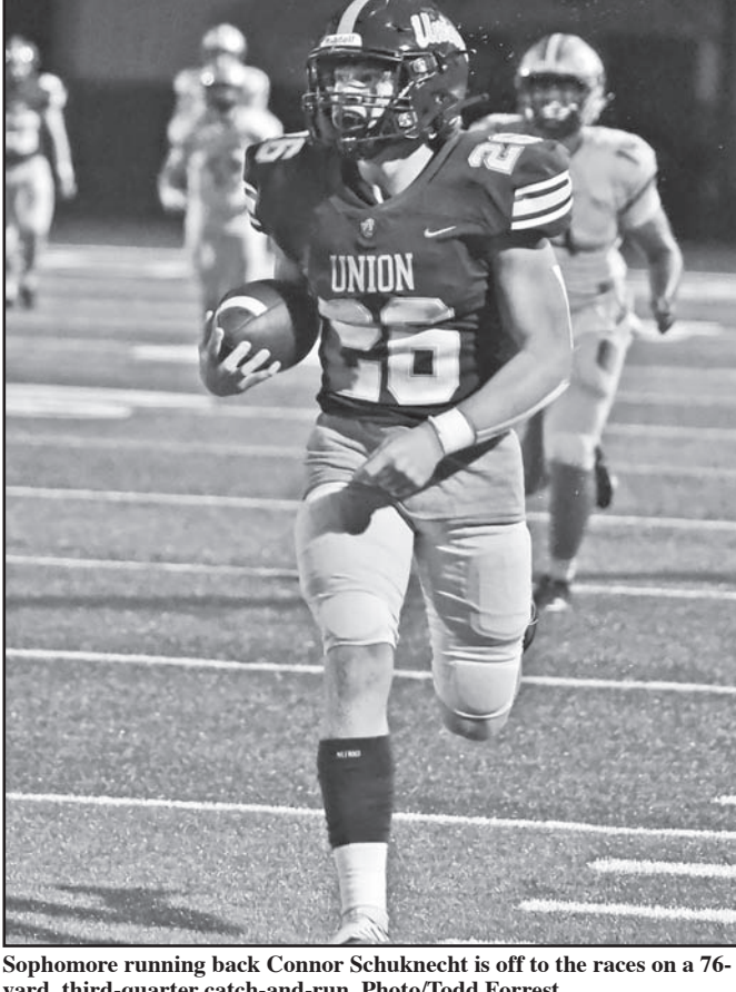
yard, third-quarter catch-and-run.

its offense another second-half opportunity, coercing Lumpkin into its third consecutive punt of the half. Union County would start from the shadow of its endzone early in the fourth, but a dropped pass on third-and-5 brought the punt team onto the